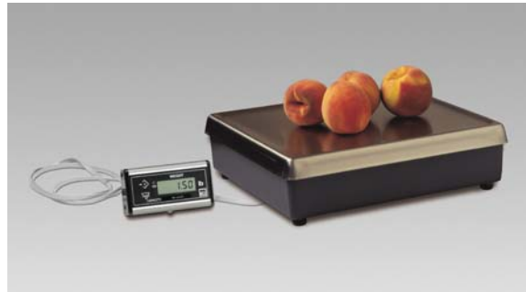
shown with remote display

Point-of-sale interface scale for linking to electronic cash registers or POS terminals.