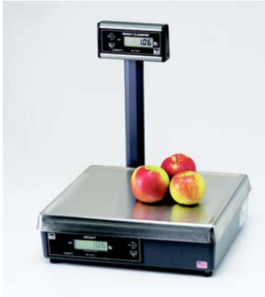
shown with internal display and optional remote post display